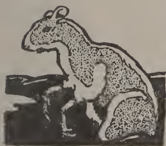
He Got His Feet Muddy.

E VELYN had always been fond of little mice. She thought they were so cunning and had such appealing little ways. So daddy thought it would be a good plan to tell the children a little mouse story for a change.